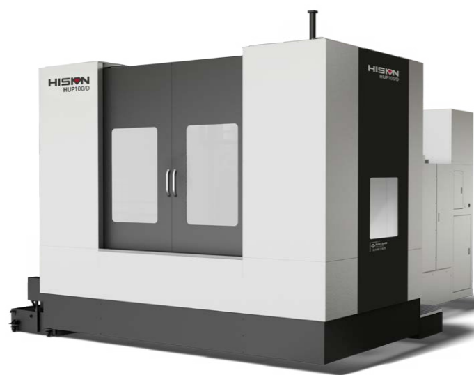
• 63H / 80H / 100H / 125H / D HUP80 / 100 / 125 / D