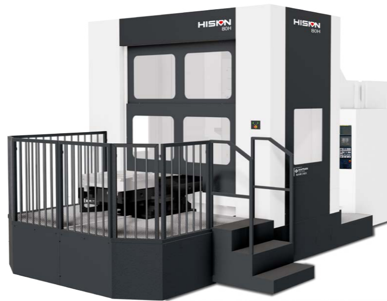
• 80H / 100H / 125H HUP80 / 100 / 125